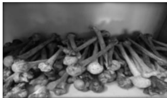
Figure 1: Humeri Collected for study

The present study was conducted with 74 dry adult human humeri. The Humeri were collected with medical students and anatomy and forensic medicine, departments of MRMC, Kalaburagi, Karnataka. We have chosen clean and unbroken humeri for study. We have excluded humeri with deformity, damaged and broken bones for study. For measuring humerus, we have used anthropometric board and vernier clippers was used for measuring segments. Each humerus was studied for the humerus segmental morphometric analysis. In present study we have measured following measurements. All the measurements were analysed and expressed in Mean±SD. SPSS 16 was used to analyse the data. The measurements includes, Maximum length of humerus, Mean distances between the articular segment of the humeral head and the greater tuberosity of humerus, Mean distance between caput humerus and callum of humerus, Mean distance between proximal and distal point of olecrane of humerus, Mean distance between distal part of olecrane process and trochlea of humerus, Mean distance between proximal edge of olecrane fossa and proximal part of trochlea of humerus. [Figure 1].